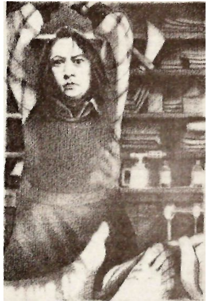
She seized the axe in both hands and moved her feet so that she was standing firmly on the floor.

Annie pulled the axe out of the mattress and threw it on to the ground. She picked up the blowlamp and lit it with a match.