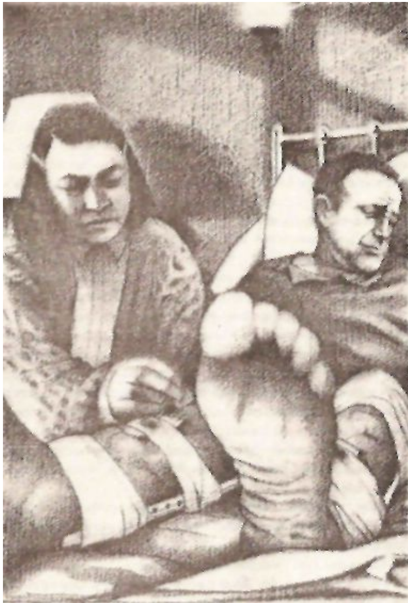
She had tied splints firmly and cleanly on to both legs.

the room, she turned back towards him and said: 'You owe me your life, Paul. I hope you remember that. I hope you'll keep it in mind.'